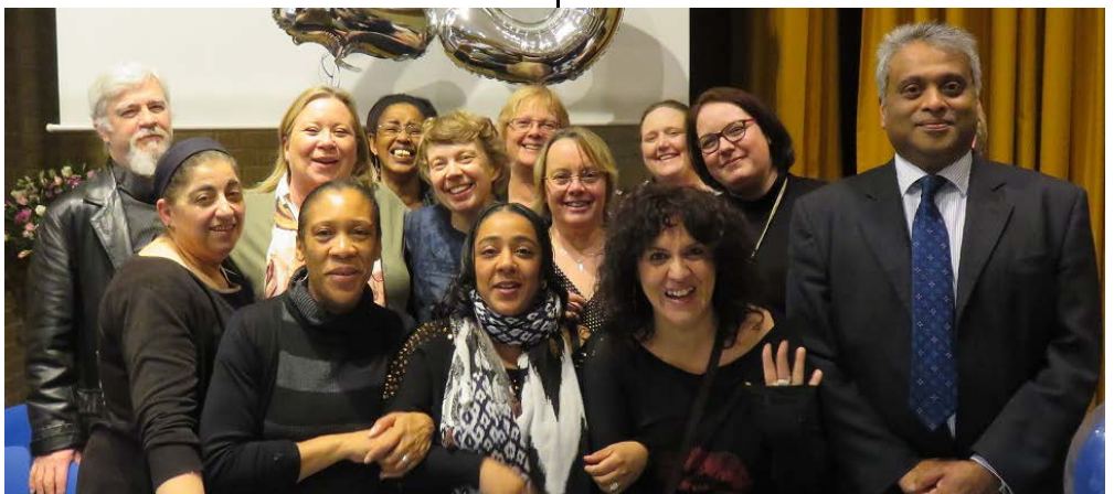
Lewisham Plus Credit Union staff and volunteers at the 25 th anniversary AGM